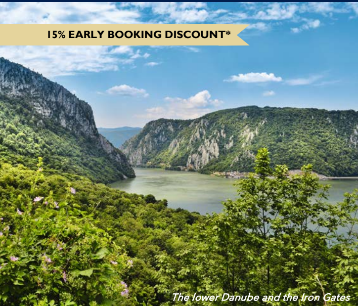
The lower Danube and the Iron Gates